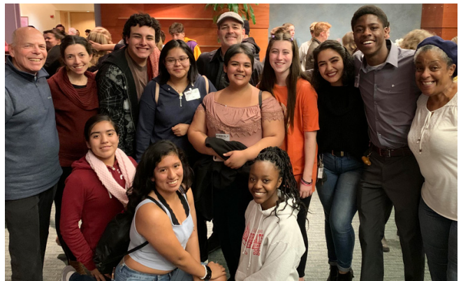
Enthusiastic SJHA students at Teen Insight in December 2019