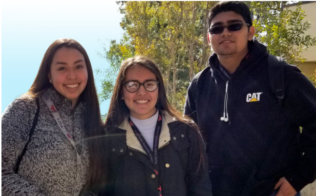
Eleventh graders from SJHA visited several Southern California colleges