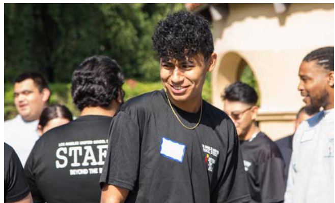
MTOC participants enjoying sunshine and companionship