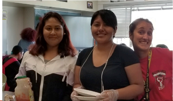
Smiles all around at the ACE Club!